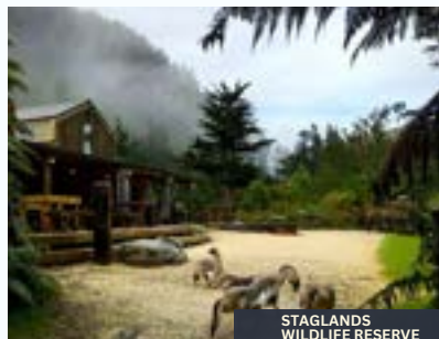
STAGLANDS WILDLIFE RESERVE